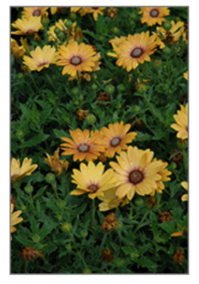
Zion Magic Orange African Daisy flowers