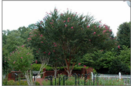
Watermelon Red Crapemyrtle in bloom

This tree does best in full sun to partial shade. It prefers to grow in average to moist conditions, and shouldn't be allowed to dry out. It may require supplemental watering during periods of drought or extended heat. It is very fussy about its soil conditions and must have rich, acidic soils to ensure success, and is subject to chlorosis (yellowing) of the foliage in alkaline soils. It is highly tolerant of urban pollution and will even thrive in inner city environments. This is a selected variety of a species not originally from North America.