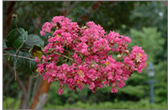
Watermelon Red Crapemyrtle flowers

Watermelon Red Crapemyrtle is recommended for the following landscape applications;