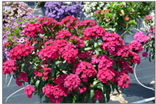
Jolt Cherry Hybrid Pinks in bloom