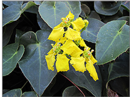
Orchid Vine flowers