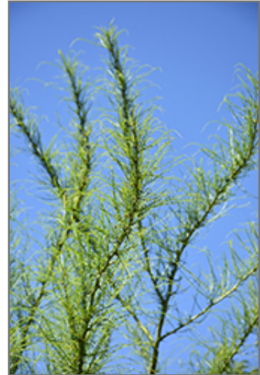
Mexican Palo Verde foliage

This tree does best in full sun to partial shade. It prefers dry to average moisture levels with very well-drained soil, and will often die in standing water. It is considered to be drought-tolerant, and thus makes an ideal choice for xeriscaping or the moisture-conserving landscape. It is not particular as to soil type or pH. It is somewhat tolerant of urban pollution. This species is native to parts of North America.