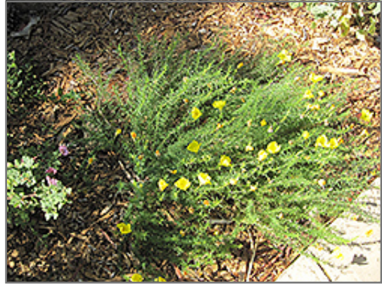
Hartweg's Sundrops in bloom