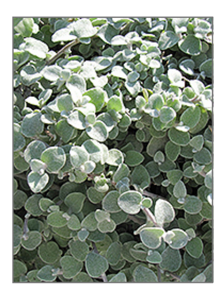
Licorice Plant foliage

Licorice Plant is recommended for the following landscape applications;