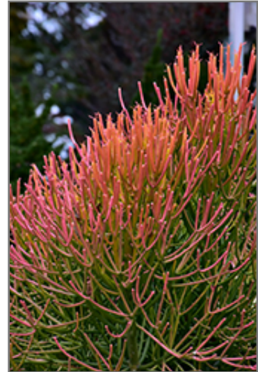
Sticks On Fire Red Pencil Tree foliage

Sticks On Fire Red Pencil Tree is recommended for the following landscape applications;