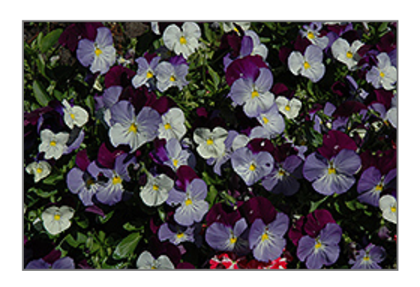
Anytime Sugarplum Pansiola flowers