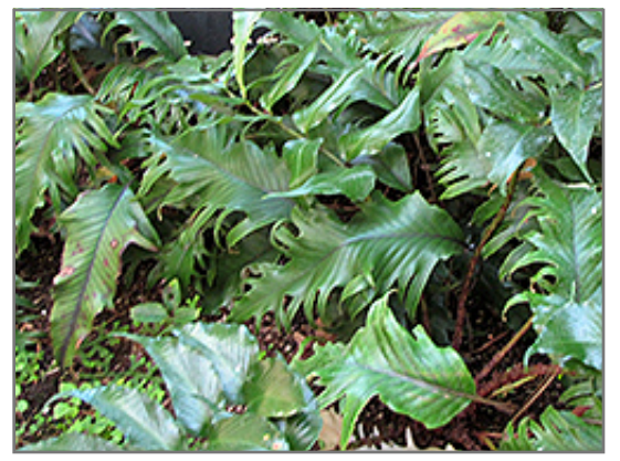
Hiryu Tongue Fern foliage