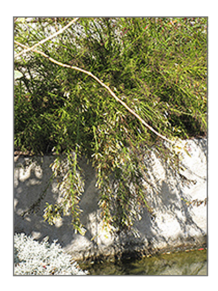
Lemon Falls Firecracker Plant