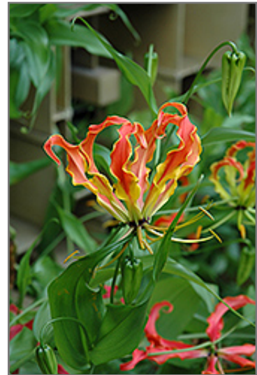
Gloriosa Lily flowers

Gloriosa Lily is recommended for the following landscape applications;