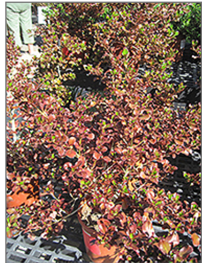
Plum Hussey Mirror Bush