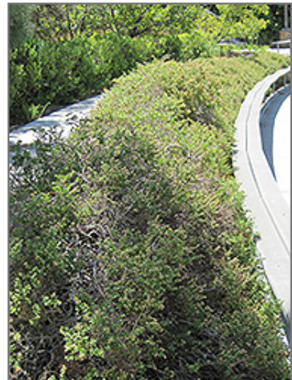
Pigeon Point Coyote Brush