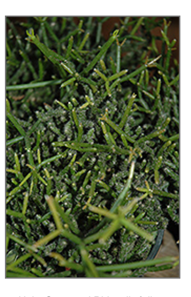
Hairy Stemmed Rhipsalis foliage