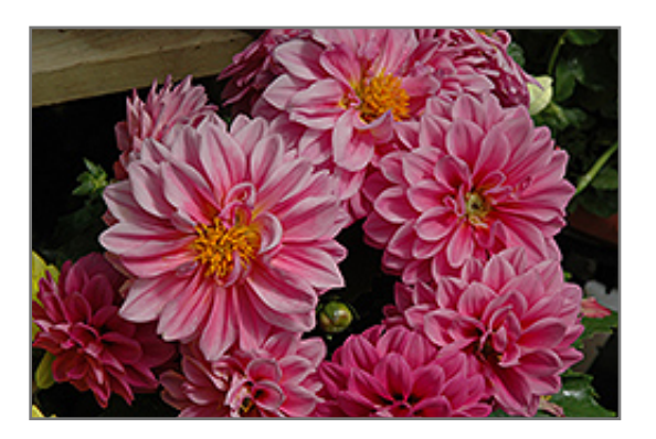
Dahlinova Hypnotica Pink Dahlia flowers