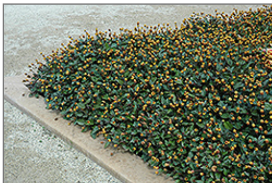
Peek A Boo Para Cress in bloom