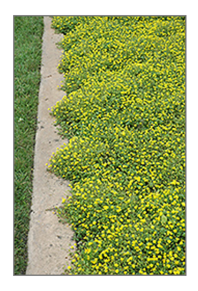
Magic Carpet Yellow Mecardonia in bloom