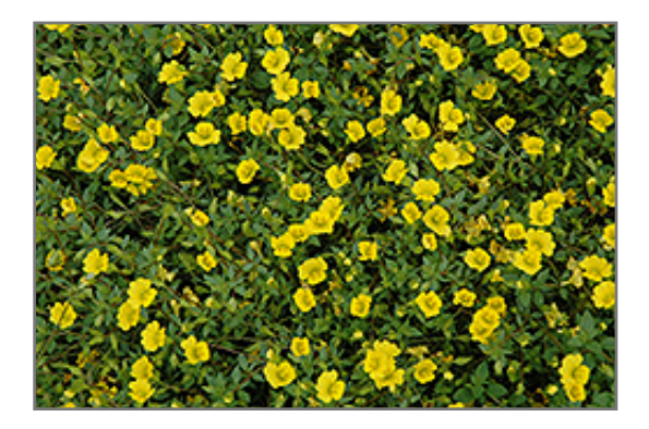
Magic Carpet Yellow Mecardonia flowers