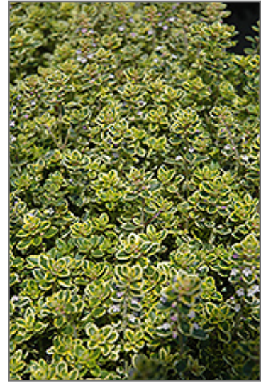
Lemon Thyme foliage

Lemon Thyme is smothered in stunning spikes of lilac purple flowers rising above the foliage from early to late summer. Its attractive tiny fragrant round leaves remain light green in color throughout the year.