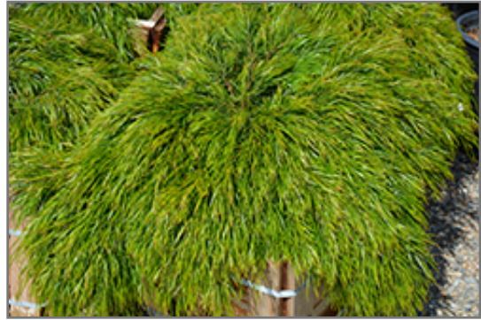
Cousin Itt Little River Wattle

Cousin Itt Little River Wattle is recommended for the following landscape applications;