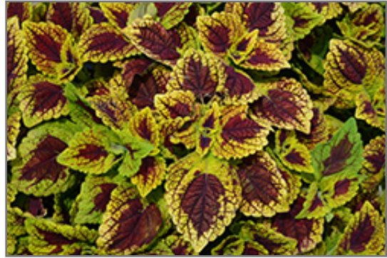
Stained Glassworks Raspberry Tart Coleus foliage