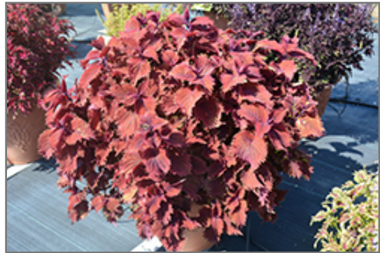
Under The Sea King Crab Coleus