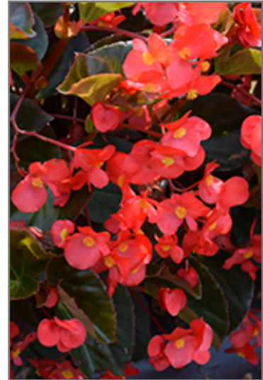
Big Red Bronze Leaf Begonia flowers

Big Red Bronze Leaf Begonia is a fine choice for the garden, but it is also a good selection for planting in outdoor containers and hanging baskets. It is often used as a 'filler' in the 'spiller-thriller-filler' container combination, providing a mass of flowers and foliage against which the larger thriller plants stand out. Note that when growing plants in outdoor containers and baskets, they may require more frequent waterings than they would in the yard or garden.