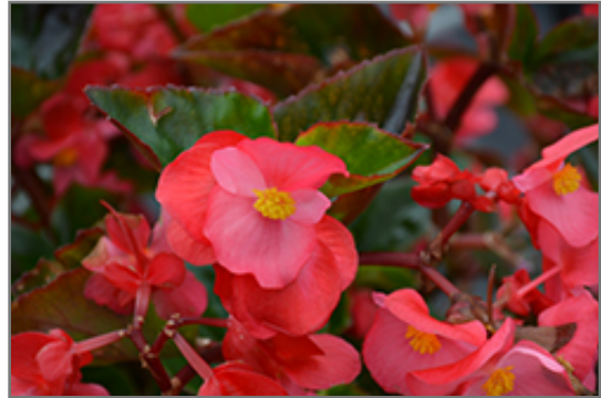
Big Rose Green Leaf Begonia flowers

Big Rose Green Leaf Begonia is recommended for the following landscape applications;