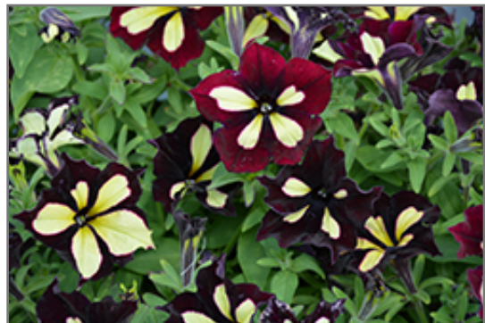
Crazytunia Star Jubilee Petunia flowers