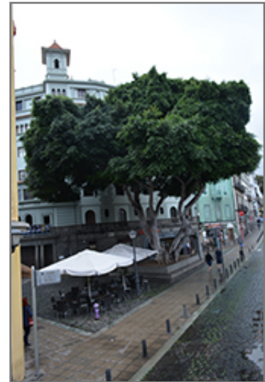
Indian Laurel Fig

This tree will require occasional maintenance and upkeep, and is best pruned in late winter once the threat of extreme cold has passed. It is a good choice for attracting birds to your yard, but is not particularly attractive to deer who tend to leave it alone in favor of tastier treats. It has no significant negative characteristics.