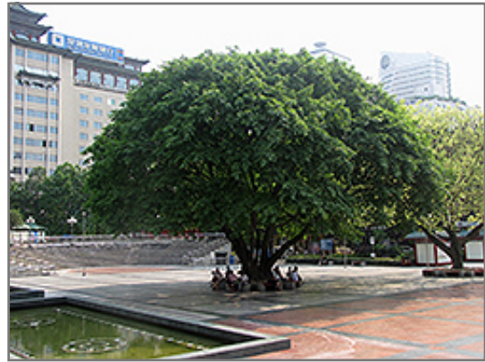
Indian Laurel Fig

Indian Laurel Fig will grow to be about 25 feet tall at maturity, with a spread of 25 feet. It has a low canopy with a typical clearance of 1 foot from the ground, and is suitable for planting under power lines. It grows at a medium rate, and under ideal conditions can be expected to live for 50 years or more.