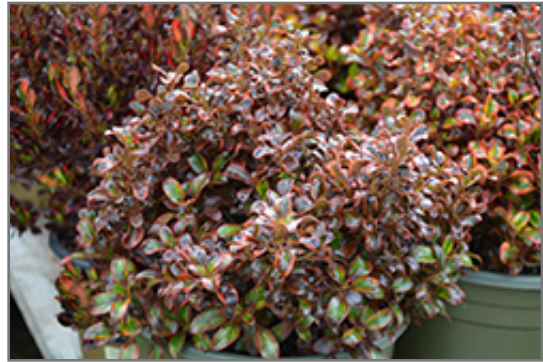
Tequila Sunrise Mirror Bush