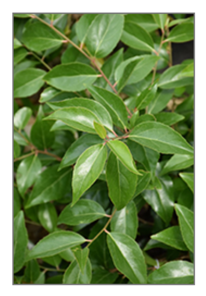
Shiny Xylosma foliage

Shiny Xylosma is recommended for the following landscape applications;