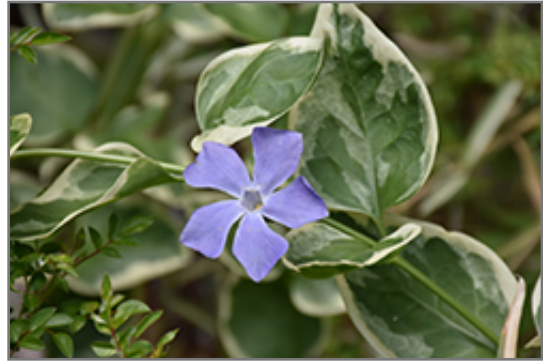
Variegated Periwinkle flowers