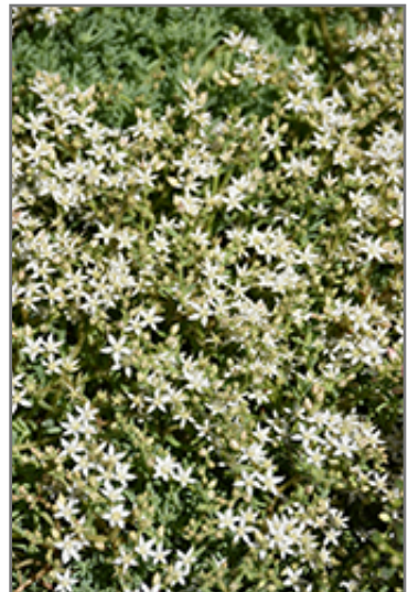
Dwarf Spanish Stonecrop flowers