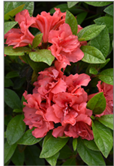
Encore Autumn Monarch Azalea flowers