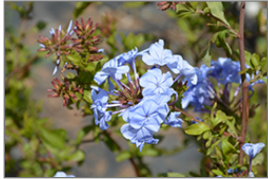
Imperial Blue Plumbago flowers

Imperial Blue Plumbago is recommended for the following landscape applications;