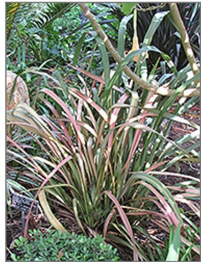
Jester New Zealand Flax