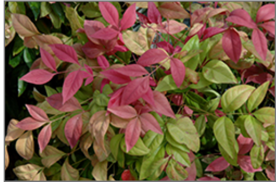
Blush Pink Nandina foliage

Blush Pink Nandina is recommended for the following landscape applications;