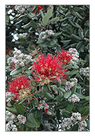
Pohutukawa flowers