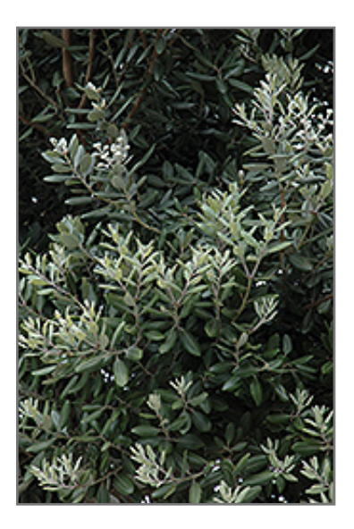
Pohutukawa foliage

This tree should only be grown in full sunlight. It does best in average to evenly moist conditions, but will not tolerate standing water. It may require supplemental watering during periods of drought or extended heat. It is particular about its soil conditions, with a strong preference for rich, acidic soils, and is able to handle environmental salt. It is somewhat tolerant of urban pollution, and will benefit from being planted in a relatively sheltered location. This species is not originally from North America.