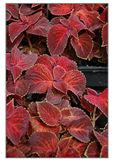
Wizard Velvet Red Coleus foliage