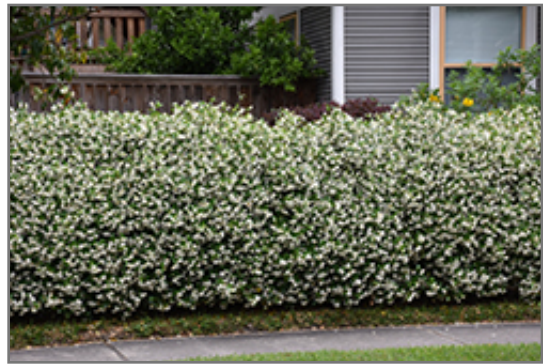
Confederate Star-Jasmine in bloom