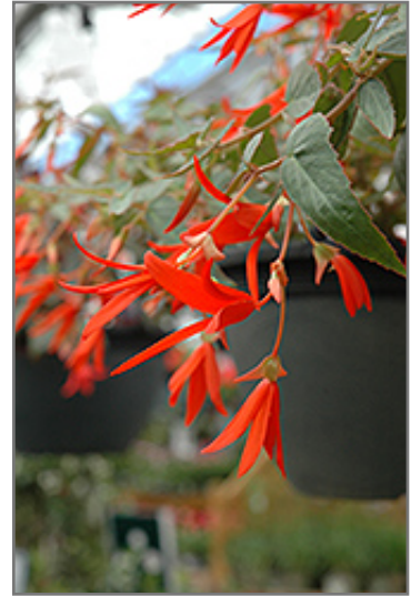
Bonfire Begonia flowers

A heavy bloomer that cascades beautifully from hanging baskets and patio containers; bright scarlet red, bell shaped flowers stand out against green toothy foliage with red edges; blooms from late spring to mid fall; deadhead to encourage new blooms