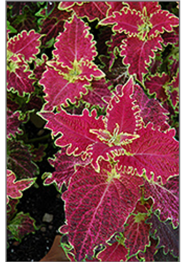
Tiger Lily Coleus foliage

Tiger Lily Coleus will grow to be about 18 inches tall at maturity, with a spread of 24 inches. When grown in masses or used as a bedding plant, individual plants should be spaced approximately 20 inches apart. It grows at a fast rate, and under ideal conditions can be expected to live for approximately 5 years. As an evergreen perennial, this plant will typically keep its form and foliage year-round.