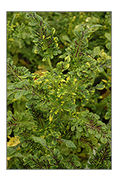
Swallowtail Coleus foliage

Swallowtail Coleus will grow to be about 24 inches tall at maturity, with a spread of 28 inches. When grown in masses or used as a bedding plant, individual plants should be spaced approximately 24 inches apart. It grows at a fast rate, and under ideal conditions can be expected to live for approximately 5 years. As an evegreen perennial, this plant will typically keep its form and foliage year-round.