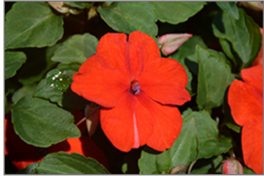
Super Elfin XP Scarlet Impatiens flowers

Super Elfin XP Scarlet Impatiens is recommended for the following landscape applications;