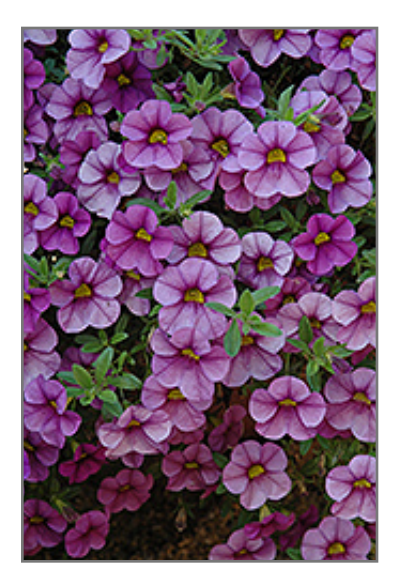
Aloha Purple Sky Calibrachoa flowers

A stunning early flowering, semi-trailing series presenting small green addition to sunny containers, hanging baskets, beds and borders; easy