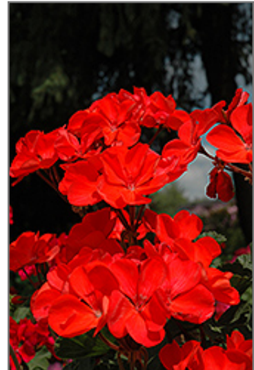
Fantasia Coral Geranium flowers