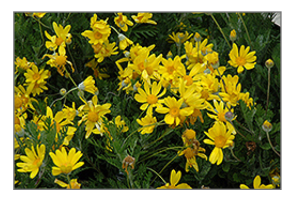
Munchkin Dwarf Euryops in bloom