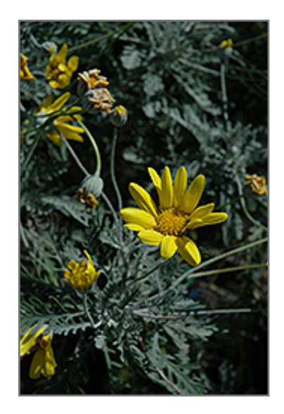
Munchkin Dwarf Euryops flowers