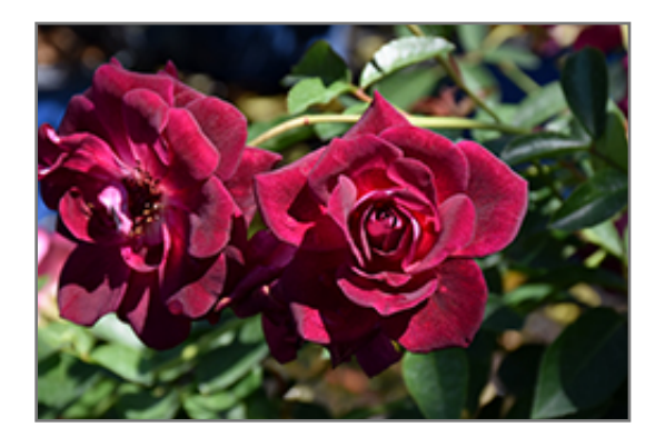
Burgundy Iceberg Rose flowers