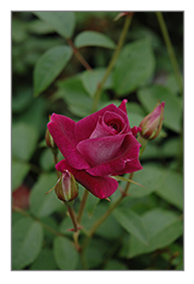
Burgundy Iceberg Rose flowers