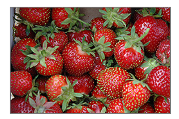
Chandler Strawberry fruit

Chandler Strawberry features dainty white daisy flowers with yellow eyes along the stems in mid spring. Its tomentose round compound leaves remain green in color throughout the season. It features an abundance of magnificent cherry red berries in early summer.