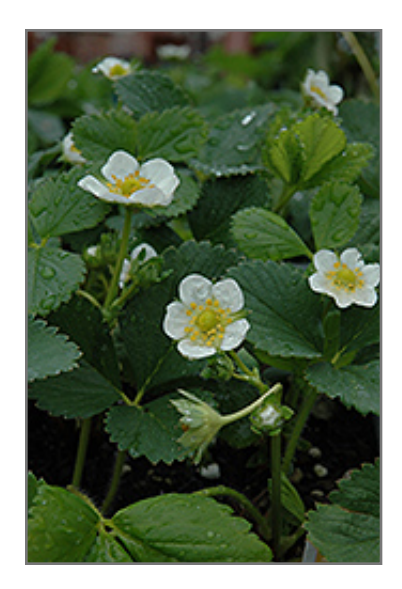
Chandler Strawberry flowers