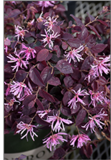
Sizzling Pink Chinese Fringeflower flowers